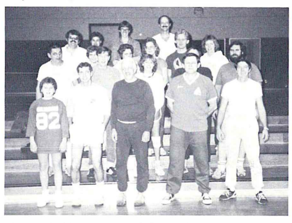
Pictured above are participants in a recent Tuesday evening turnout.

Each Tuesday evening at 7:30 p.m. several of our employees and their families meet at Young School to enjoy a game or two of volleyball. In addition to having a lot of fun, it's a good way to stay in shape over the winter months.