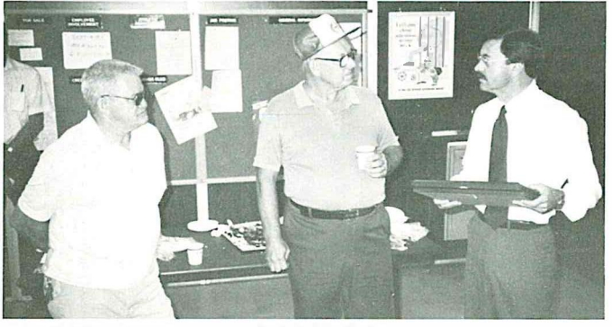
Lloyd Nicodemus Machine Shop